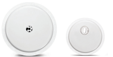
One (1) FreeStyle Libre 2, FreeStyle Libre 2 Plus or FreeStyle Libre 3 sensor