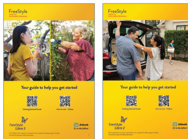
Getting Started Guide